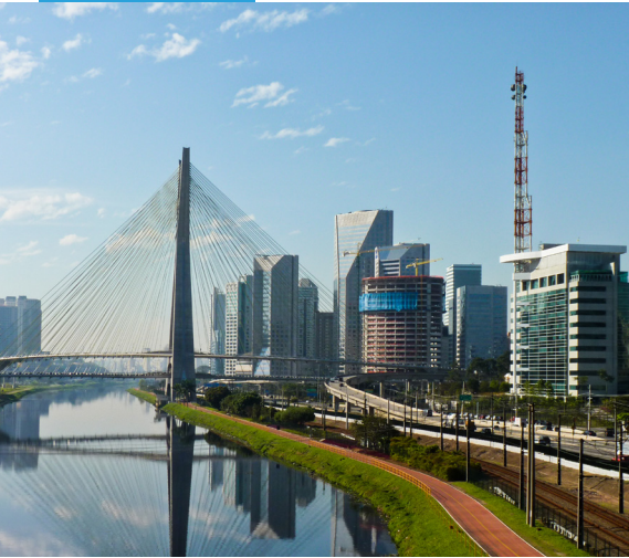
São Paulo, Brazil